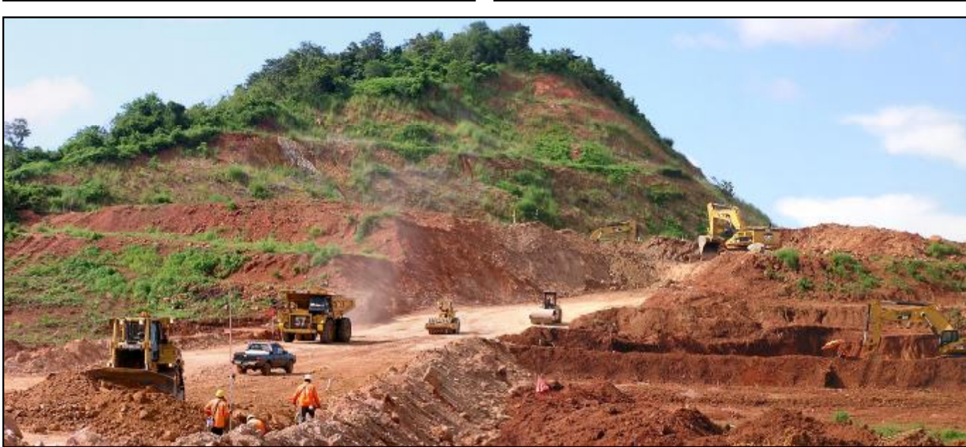
Kingsgate Consolidated Limited - Quarterly Report for three months ended 30 September 2008