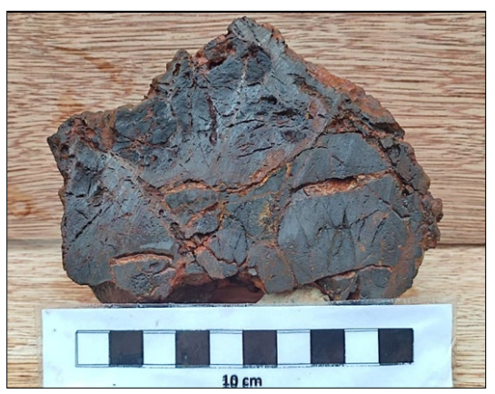
Figure 2: Rock slab from Au anomaly area in Sua Dum (left) calc-silicate rock crosscut by quartz vein/veinlet (right) Iron skarn with hematite ± quartz stained in fracture and trace of chalcopyrite

Infill RAB drilling concentrated in SPL24/2563 along NE trending and the eastern part of the Chang Puek prospect. Strong phyllic to silicified sandstone with trace of sphalerite and pyrite dissemination was found, assaying 33989RA: 3m @ 0.26 g/t Au from 9m to 12m.