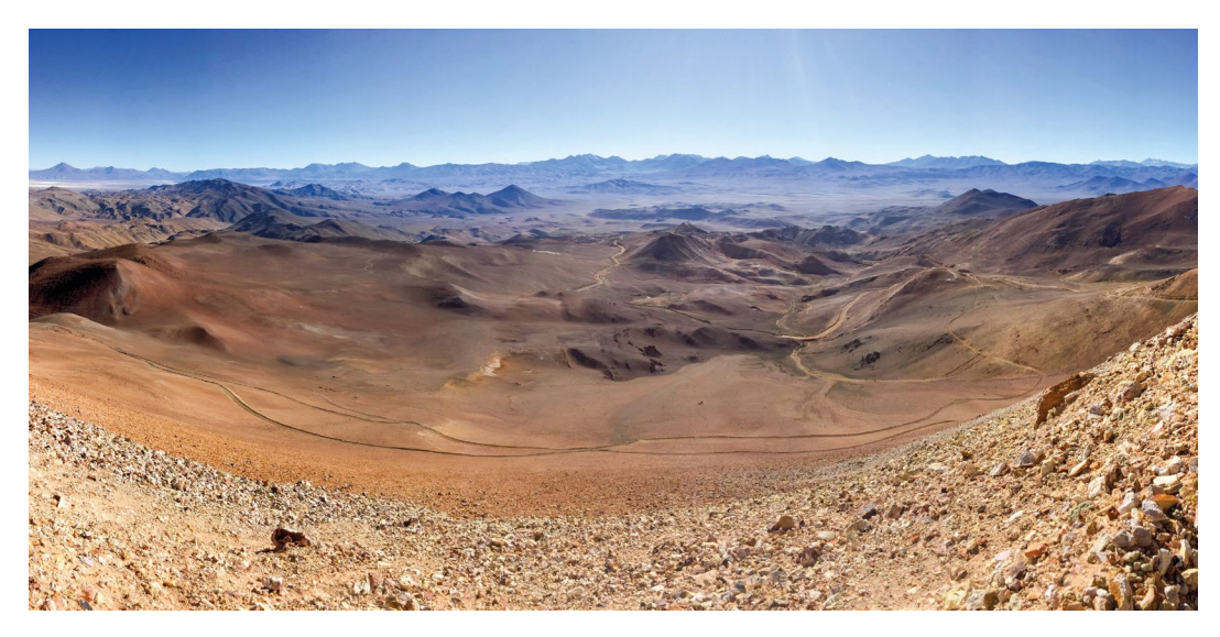
Nueva Esperanza site looking east

Kingsgate continues to advance divestment of the Nueva Esperanza Project and is working with several parties who are completing their due diligence, with one party undertaking a successful site visit in early August 2023, and have reconfirmed their continuing interest in acquiring the asset. Kingsgate has made all non-essential staff redundant to reduce ongoing holding costs of the project.