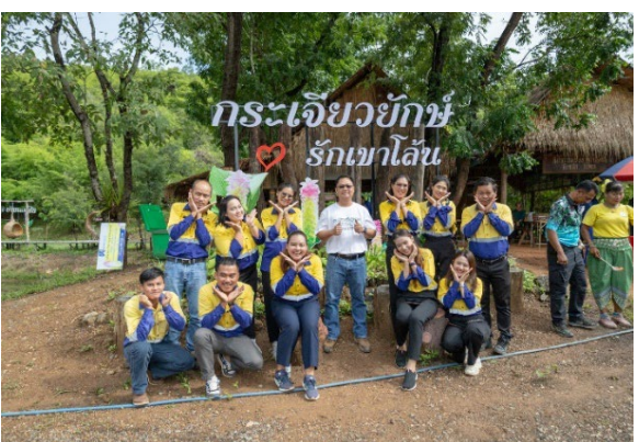
Village Development Fund and Health Assurance Fund committee meeting and Akara staff supporting The Krajaew Blossom Festival in Phichit