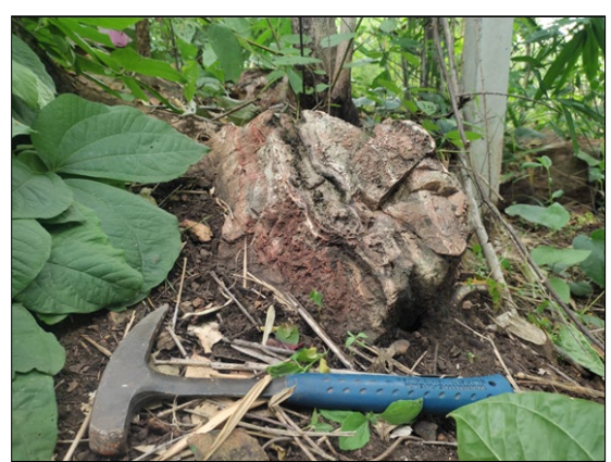
Figure 1: Outcrops of calc-silicate rock in Khao Rang Tan, SPL7/2563 (left) show propylitic altered rock with 1% of quartz \pm sulphide veinlet (right) shows weak silicified with 0.5-1cm thick quartz vein/veinlet in NE-SW trend