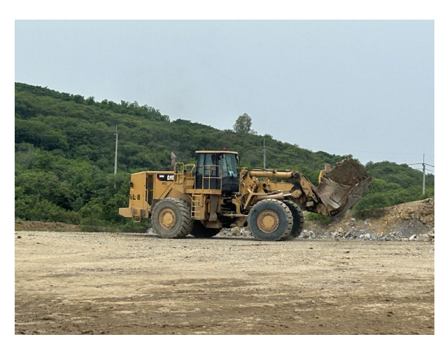
Pump installation at A Pit North and the one millionth tonne being delivered to the crusher at Chatree