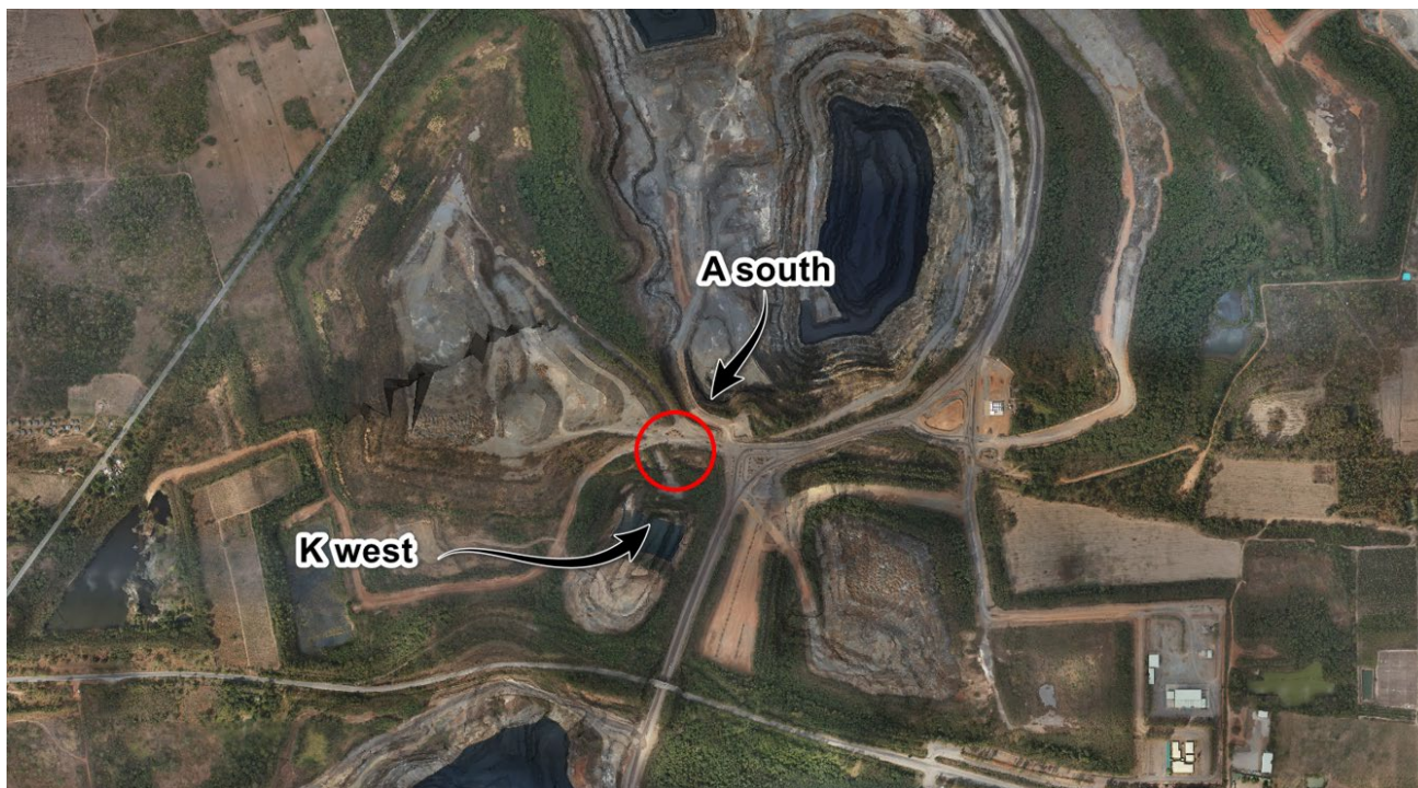
Location of the grade control drilling