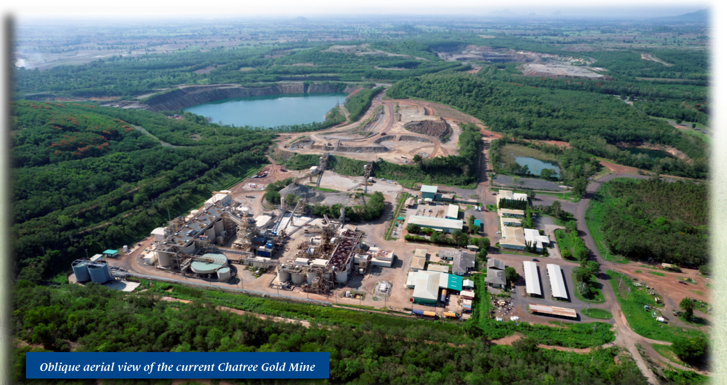
Oblique aerial view of the current Chatree Gold Mine