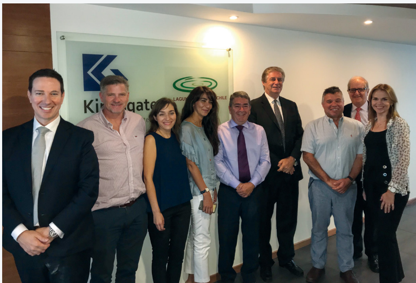
Kingsgate and Laguna Resources staff discussing the Nueva Esperanza Project in Santiago, Chile.

Other notable events during the year include the Metal Tiger failed Board spill attempt.