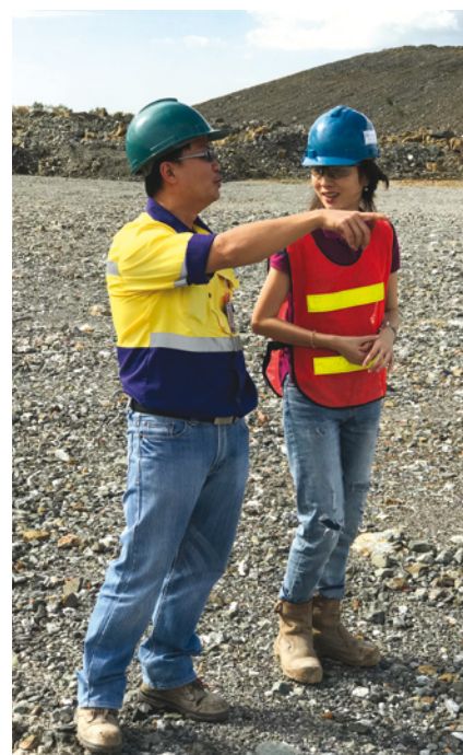
Akara Resources staff inspecting rehabilitation works at Chatree.