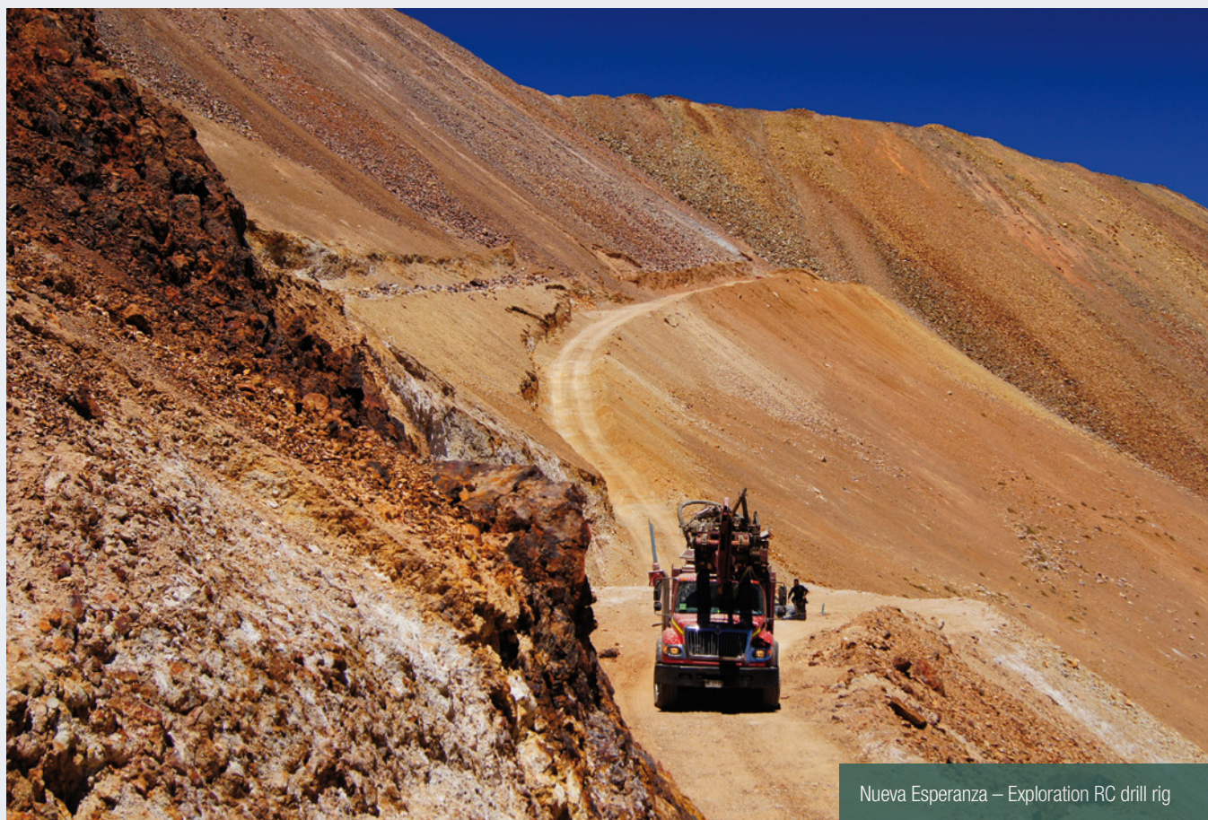
Nueva Esperanza – Exploration RC drill rig

The Company anticipates that any remaining balance of the proceeds, after expenses of the sale and after providing for the aforementioned expenditure, will be distributed to shareholders.