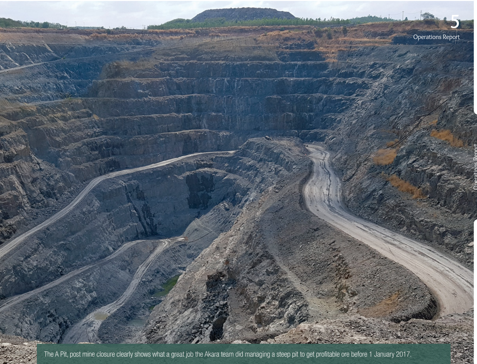
The A Pit, post mine closure clearly shows what a great job the Akara team did managing a steep pit to get profitable ore before 1 January 2017.