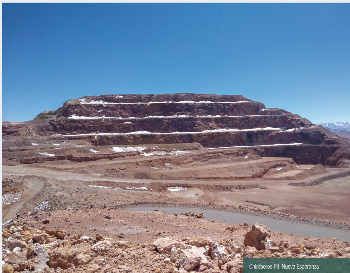
Chimberos Pit, Nueva Esperanza

Kingsgate has been building its regional exploration portfolio in the northern Maricunga Belt. The Company currently has a number of licences and areas under application to the north of Nueva Esperanza. The concessions and concession applications cover large areas of intense, high-level alteration considered prospective for epithermal precious-metal deposits.