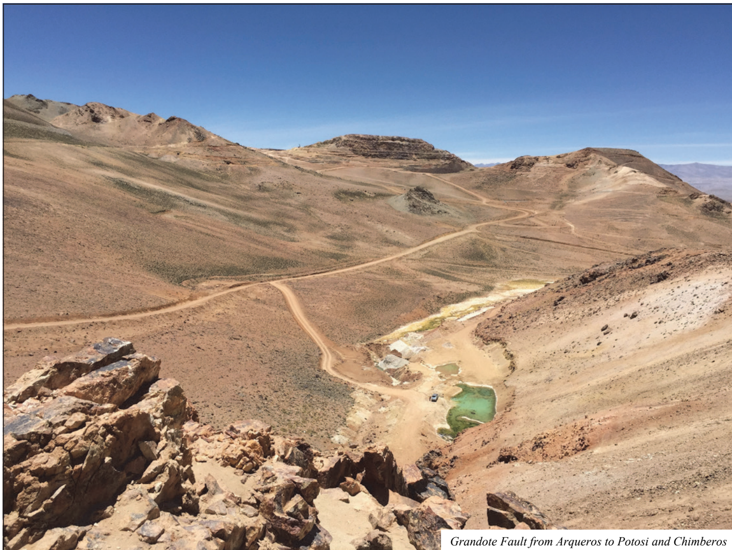
Grandote Fault from Arqueros to Potosi and Chimberos