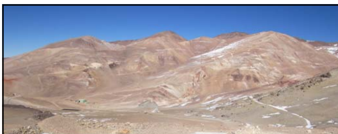
Looking to Chimberos and Arqueros at Nueva Esperanza

The DFS provides the basis to assess the optimum financing strategy for the project. Discussions are already underway with potential debt financiers, with several financing options being considered.