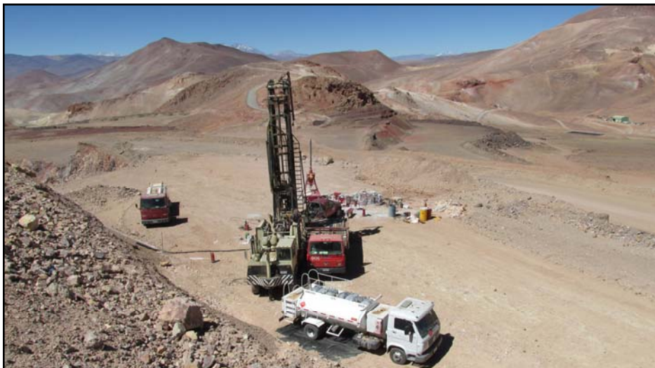
Resource drilling at Chimberos, Nueva Esperanza Project, Chile