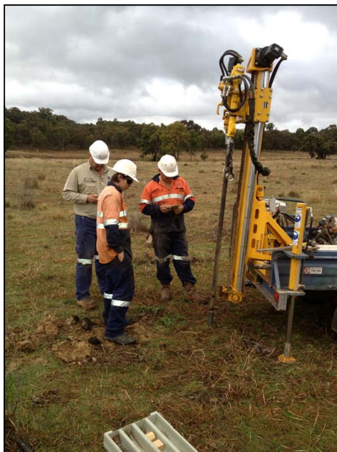
Testing topsoil depths and geochemistry, Bowdens Silver Project

A complete review of all the components required for EIS lodgement with the specialist consultants have confirmed that Kingsgate remains on track to lodge in the second half of 2014.