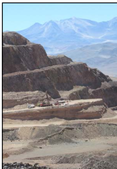
Resource drilling at the Chimberos pit, Nueva Esperanza Project, Chile