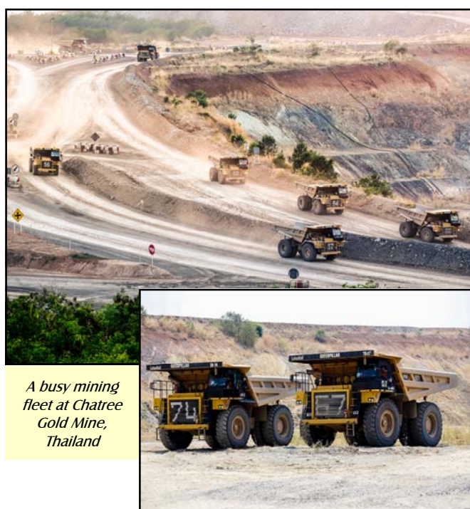
A busy mining fleet at Chatree Gold Mine, Thailand